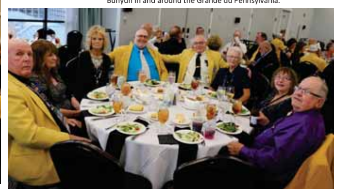
Some of the Illinois delegation enjoying the camaraderie of the Friday evening banquet