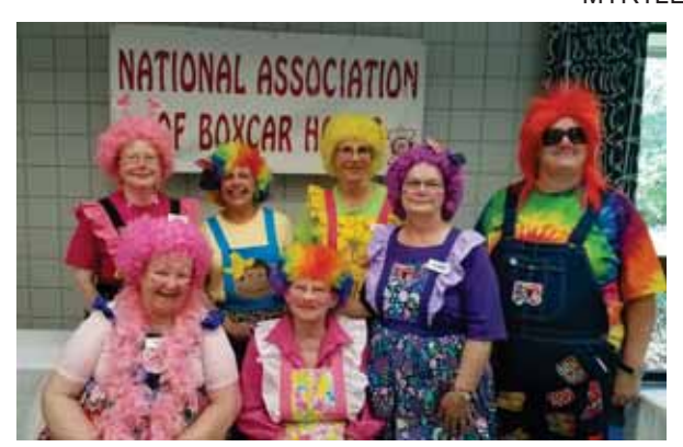
Always the kids favorite, the Grande Cabane Wisconsin Hobo Clowns grew by two this year for the annual National Box Car Association Children's party.