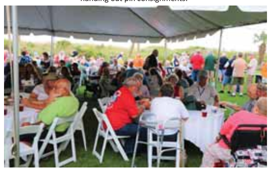
Approximately 300 attended the Early Bird party on Tuesday evening.