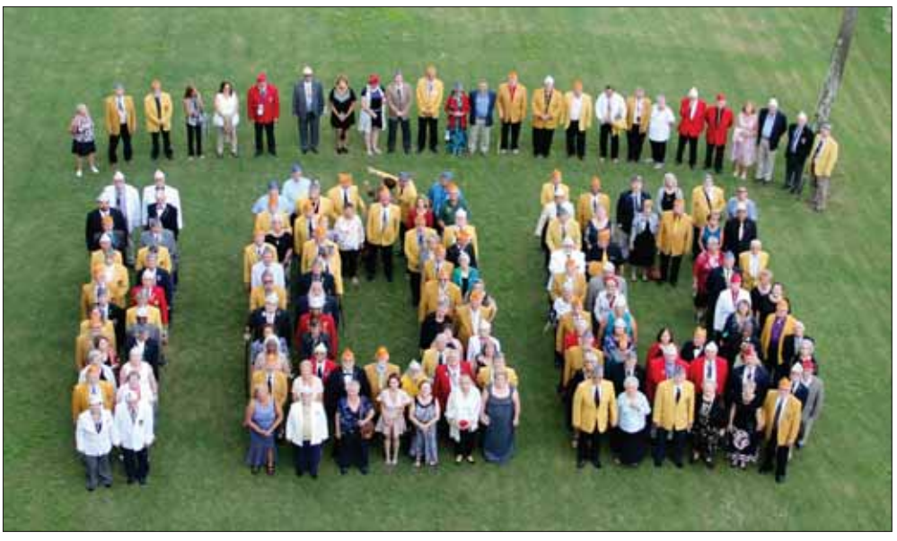
Voyageurs and Dames got together before the Friday evening banquet in Myrtle Beach to help celebrate the 100th Anniversary of the Forty et Eight by making a huge 100 out of the back lawn.