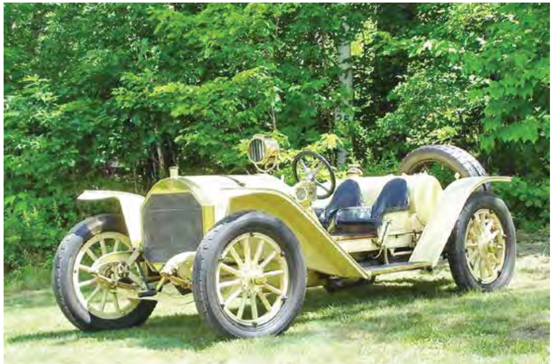
This is a 1911 Mercer 35R Raceabout, the only one known to still exist.

Road racing stumbled on, but by the close of World War I, oval tracks had become the default American venue. Meanwhile, after Europe recovered from the devastation of war, the motorsports community found ways to develop road circuits as viable venues. This was reinforced through the support of manufacturers steeped in the culture of road racing. Q