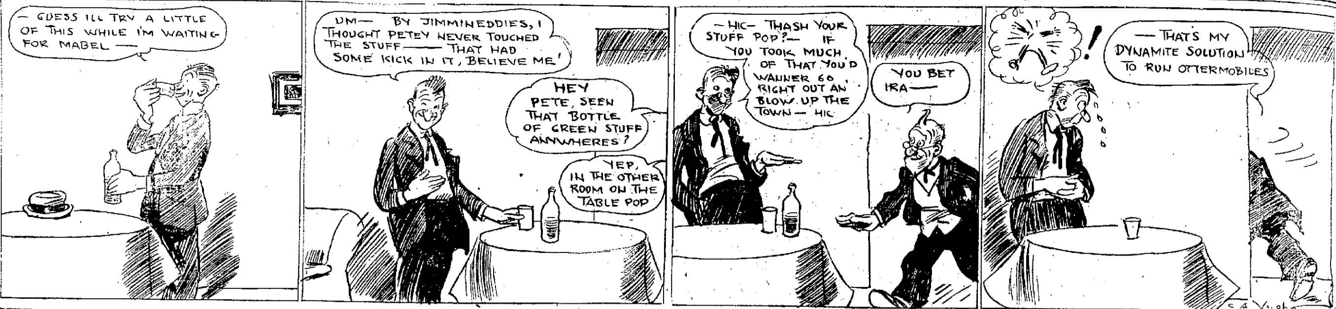
PETEY DINK—YES, THAT DRINK SHOULD HAVE QUITE A DYNAMIC KICK.