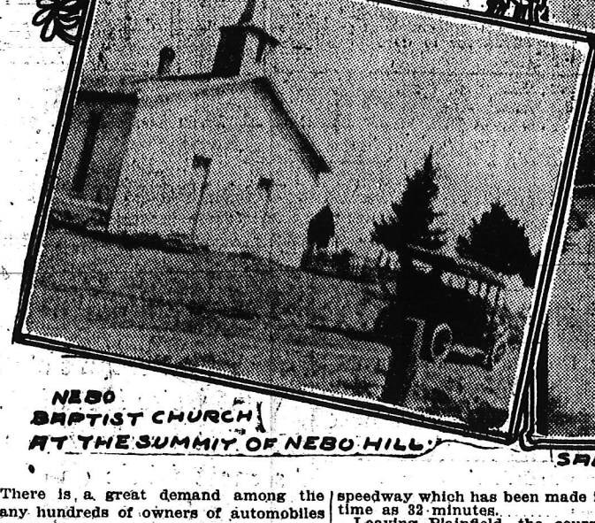
NEBO BAPTIST CHURCH AT THE SUMMIT OF NEBO HILL