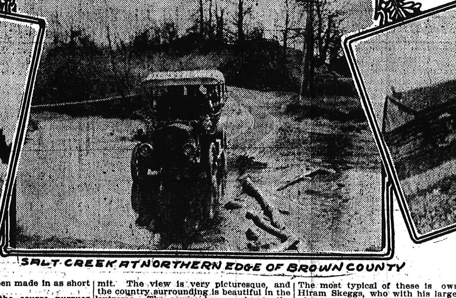
SALT CREEK AT NORTHERN EDGE OF BROWN COUNTY