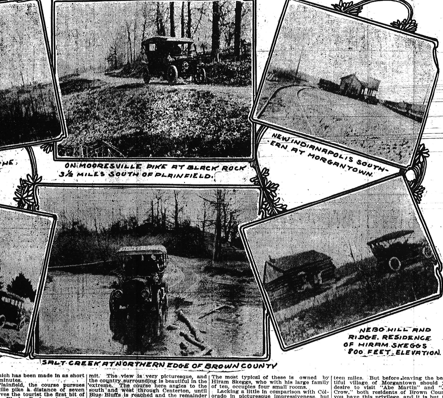
ON MOORESVILLE PIKE AT BLACK ROCK 3 1/2 MILES SOUTH OF PLAINFIELD.