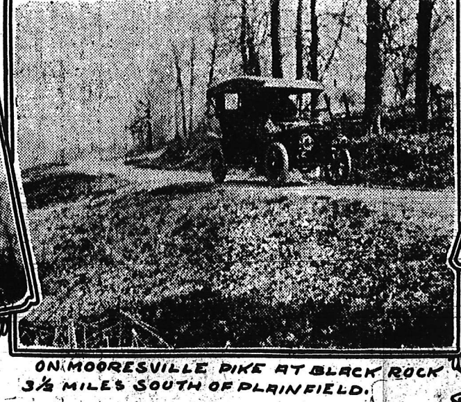
ON MOORESVILLE PIKE AT BLACK ROCK 3 1/2 MILES SOUTH OF PLAINFIELD.