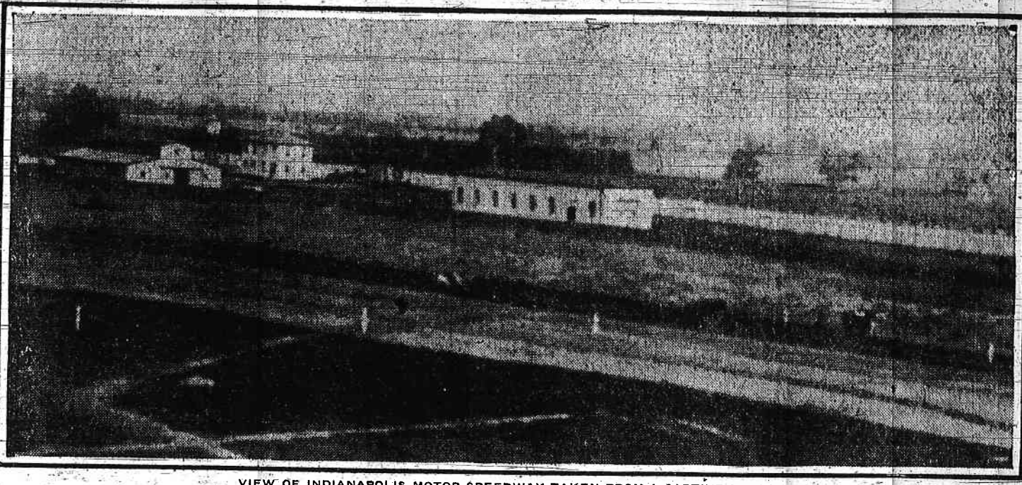
VIEW OF INDIANAPOLIS MOTOR SPEEDWAY TAKEN FROM A CAPTIVE BALLOON.