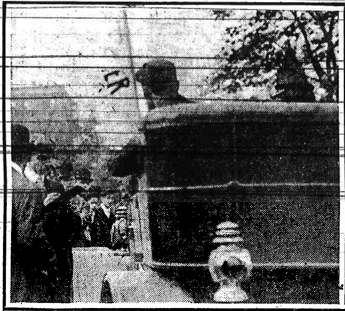
THE PREMIER CHECKING IN.