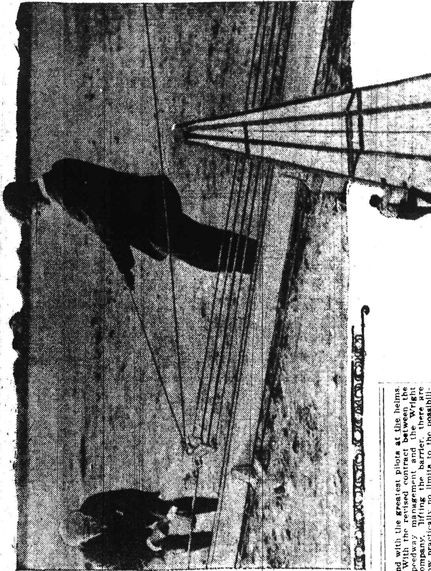
and with the greatest pilots at the helms. With the revised contract between the Speedway management and the Wright Company, lifting the barrier, there are now practically no limits to the possibili-