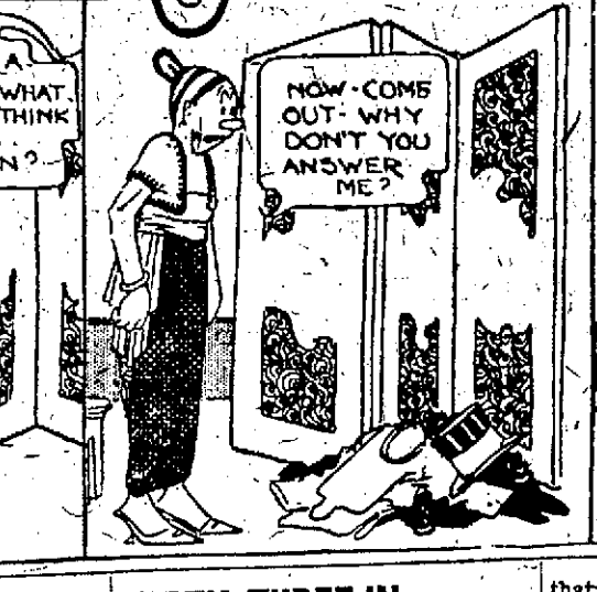
THROW YOUR OTHER CLOTHES OVER THE SCREEN.