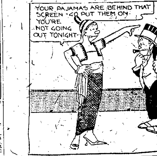
YOUR PAJAMAS ARE BEHIND THAT SCREEN—DO PUT THEM ON.

WE HAVE a large list of improved farms all over the state. Write for sale or trade for city property. Submit your offer. Call Wisconsin Land Co., Room 8, Continental Bldg., 12 18