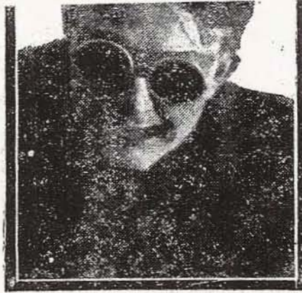
Barney Oldfield as he appears when driving the "Green Dragon."

Arrangements are being made for an illuminated parade Saturday night.