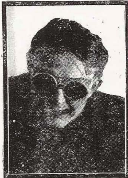
Barney Oldfield as he appears when driving the "Green Dragon."

Three years ago Oldfield began the construction of a home-made machine that afterwards revolutionized the construction of racing cars. With his crude speed creation the champion met the foreign drivers and defeated them in short order, and then went