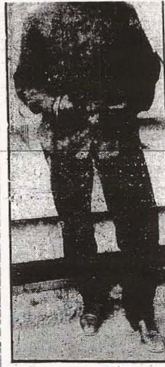
Hitherto Unpublished Photo of Barney Oldfield