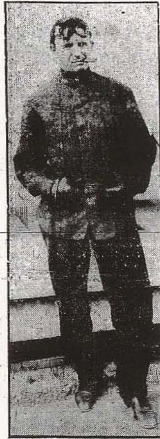
Hitherto Unpublished Photo of Barney Oldfield

The beach was in the finest condition known yesterday.