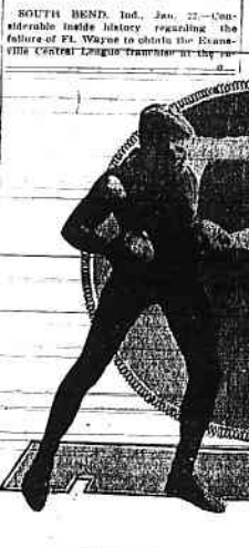
DE PAUW IS BEATEN INDIANA A VICTOR 26 TO 16