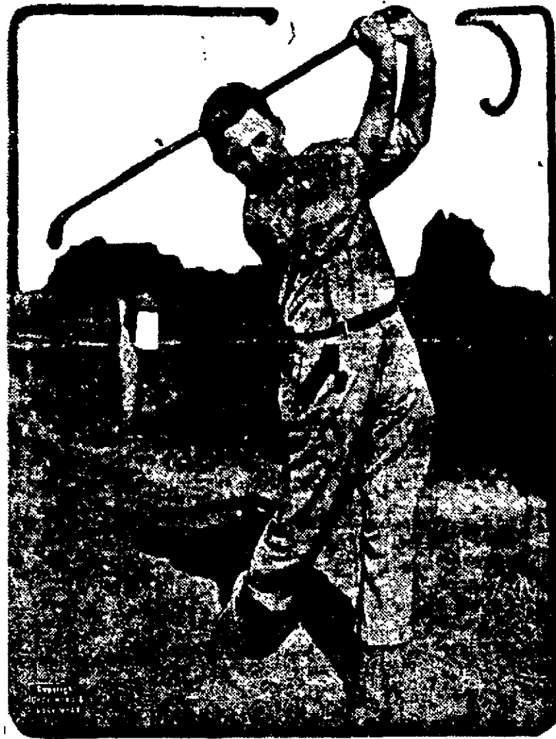
RANKS WITH BEST AMERICAN GOLF PLAYERS.

"Little Bobby" Jones, the most famous boy in the United States owing to his almost reaching the semifinal round for the national golf championship, devotes himself with as much earnestness and success to his studies in the Tech high school here as he does to winning golf matches, says an Atlanta dispatch to Philadelphia Public Ledger. Last year, in the first grade in the Tech high school, he took second year Latin in addition to his regular first year studies, and did it of his own volition. The Tech instructors who have taught "Little Bob" say there is no better student in the school.