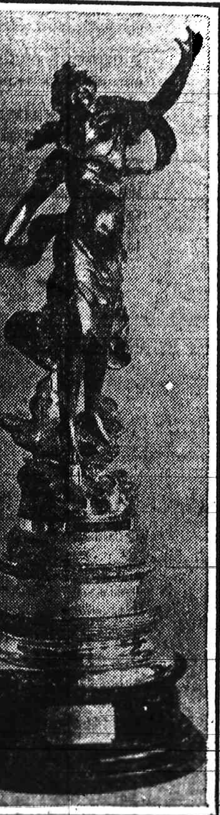
Hatley Hills Sweepstakes trophy, by Harroun driving a Marmon recent race over the Vanderbilt Long Island is now on exhibit. The collection of race trophies at an exhibition. It is the largest the collection, and is valued at

...touring is the number of Americans who now visit Europe in American automobiles. Everything has been made so simple by the various touring associations that the American automobilist plans for a tour through Europe with as little fear of difficulties as if he were about to make a run through the Berkshires.