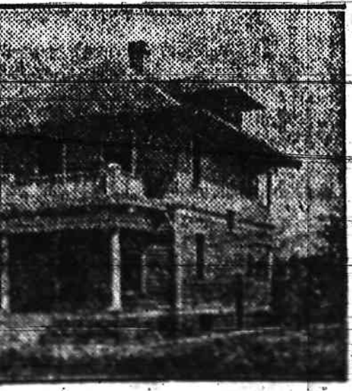
SUBURBAN HOME ON MENTS LIKE RENT.