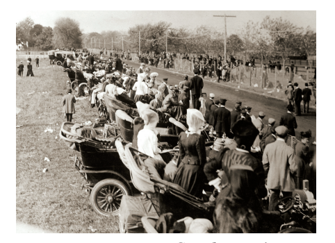
THE CROWDS: Crowd control was an oxymoron at the first Vanderbilt Cup race. People lined the course like a retaining wall or wandered out onto the running surface.

Vanderbilt, working with the American Automobile Association (AAA), charted a triangular, 32.5mile course on New York's Long Island that sliced through villages and spanned long sections of countryside. The course was three long stretches of relatively straight road, connected by three sharp turns. The Massapequa Road was the shortest link, at six miles, and passed by the homes and small businesses in a hamlet known as Central Park and the village of Hicksville. The Jericho Turnpike was a 12.5-mile stretch that led to Queens and the nearby Belmont race course, which was under construction at the time. The longest stretch was 14 miles in length, and cut through another village, Hempstead. Between villages there was open prairie, cabbage farms and huge shade trees. The entire course was a macadamized, or crushed stone, surface and to settle dust, it was oiled at a cost of $5,000 with 90,000 gallons of raw petroleum. Oil puddles splashed a sticky mud mix onto the cars and drivers. But it also helped them identify the right path instead of mistakenly chasing down adioining roads