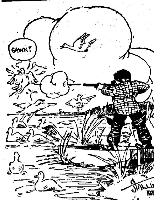
ANY WINTER HE CAN BE FOUND BOUNCING SHOT OFF THE DUCKS UP IN 'ILL-O-NOI'